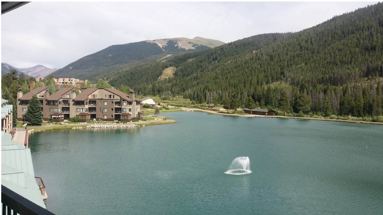
View of the mountains from Lakeside Village at the Keystone Resort.