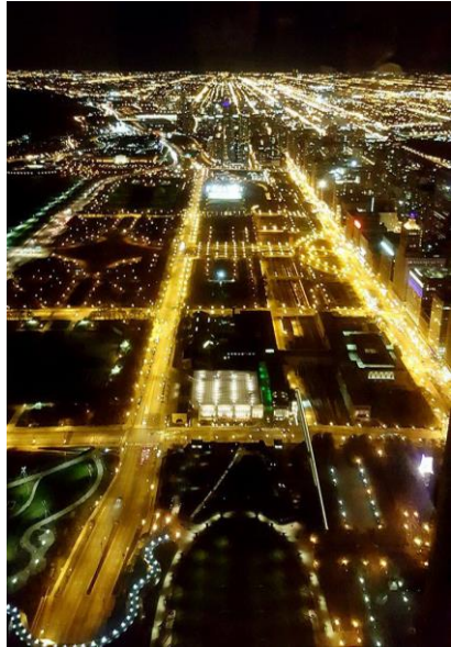
APSA Welcome Reception view from the 80 th Floor